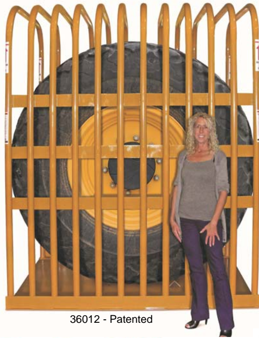
36012 - Patented

Mandatory for any shop working with tubeless and multi-piece rims. Guards against blown lock rings and rims. Designed to meet OSHA reg. 29-CFR Part 1910.177.