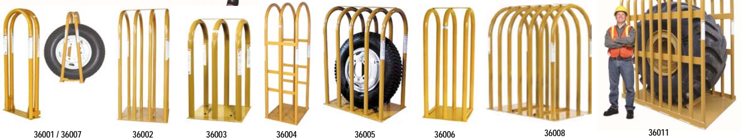
36001 / 36007